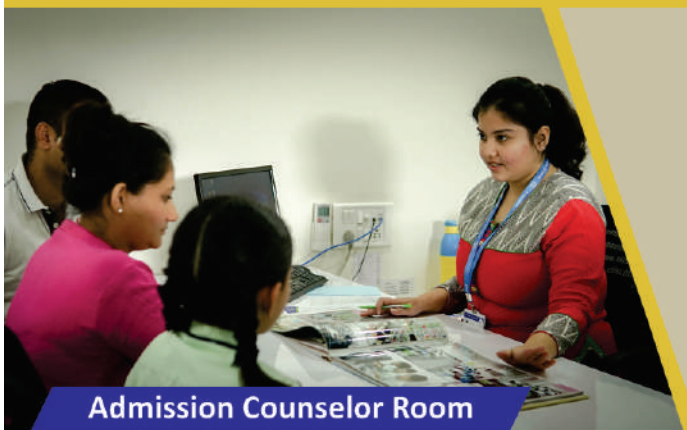
Admission Counselor Room