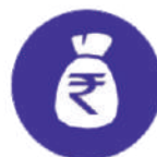
FINANCIAL LITERACY PROGRAMME