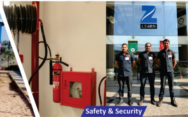
Safety & Security