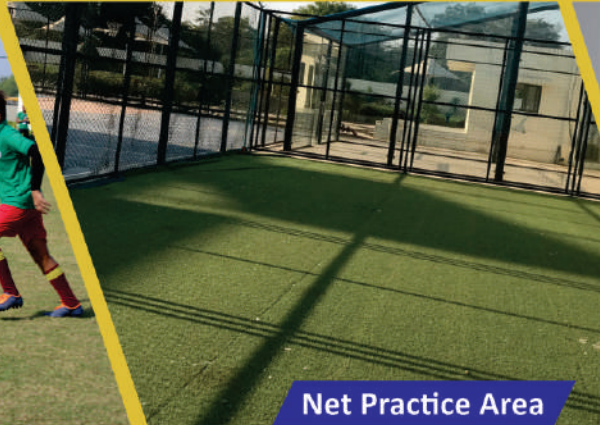
Net Practice Area