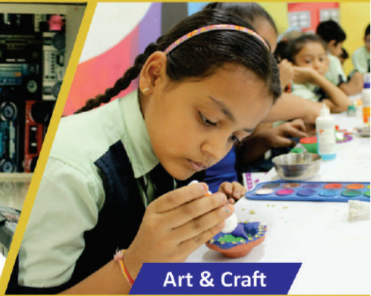
Art & Craft